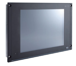
▲ Touch without keypad version