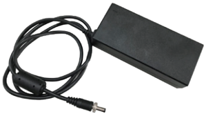
▲ AC power adapter (for MPC102-845-J)