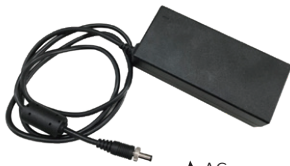
▲ AC power adapter (for MPC103-845-J)