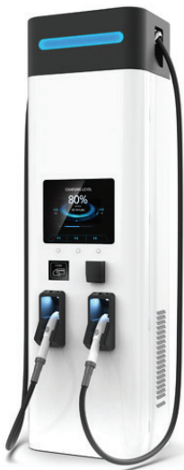
Application : Electric Vehicle Battery Charger

ESTECOM's 15" All in one PC monitor is a premium line of highly customizable, HMI touch monitor for the various industrial applications. Engineered for light speed touch response, allowing fluent drag and drop actions with finger tips, gloves and stylus. This high end product adopts anti-bacterial touch screen to prevent virus infection during the operation. ESTECOM's products deliver an innovative, high performance multi-touch display system far exceeds the industrial standards.