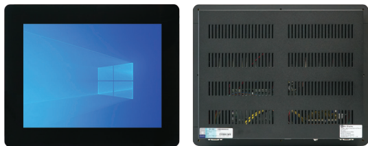
All in one PC Monitor