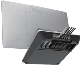
Connect hub to stand, supports separate operation